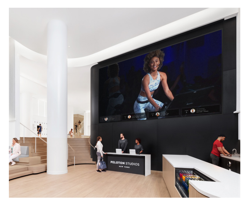
The All-New Peloton Studios New York